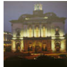
The Davenport Hotel - Dublin

Conventus LLP Home Farm Buildings Home Farm, Netherhampton Salisbury, UK, SP2 8PJ T: +44 (0) 1722 742603 F: +44 (0) 1722 744083 E: EBOPRAS@conventus.com W: www.conventus.com/EBOPRAS